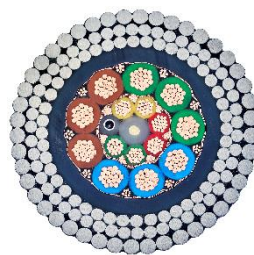
Figure 2: Cable cross section.