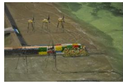
Figure 2 Example of measuring wave field

To improve the understanding of these physical processes associated with waves, wave structure interaction, stability of structures or the influence on morphology various measurements techniques like time sampling, lasers scanning, photography are employed to capture instant information on wave conditions, forces, currents, erosion and accretion for further detailed analysis.