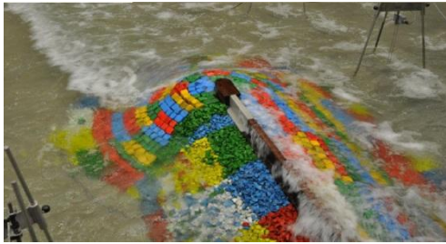
Figure 1 Example of obtaining wave field information near trunk of a breakwater

The FBI uses wavelet techniques for image compression of digital fingerprints to save storage space. In geophysics wavelets are being used to analyse seismic signals for detecting e.g. earthquakes and oil layers. In finance the wavelet is used to analyse stock markets due to their dynamic and non-linear nature. These are just a few examples to highlight the applicability of the wavelet techniques.