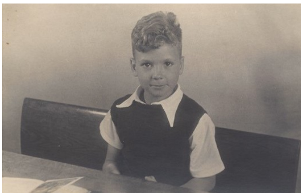
FIG 2. Piet at primary school.

during World War II. My father is in particular mentioned in this book in connection with the so-called “Test sentence”. He argued before the Supreme Court on October 27, 1941 that the judge had the authority to challenge the regulations of the occupying force on the basis of the regulation prescribed for a country at war, the decree of the Führer and the first regulation of the government commissioner. When the Supreme Court later denied the possibility of contesting rules issued by the German government, the Netherlands followed what was the rule in Germany and Italy too.